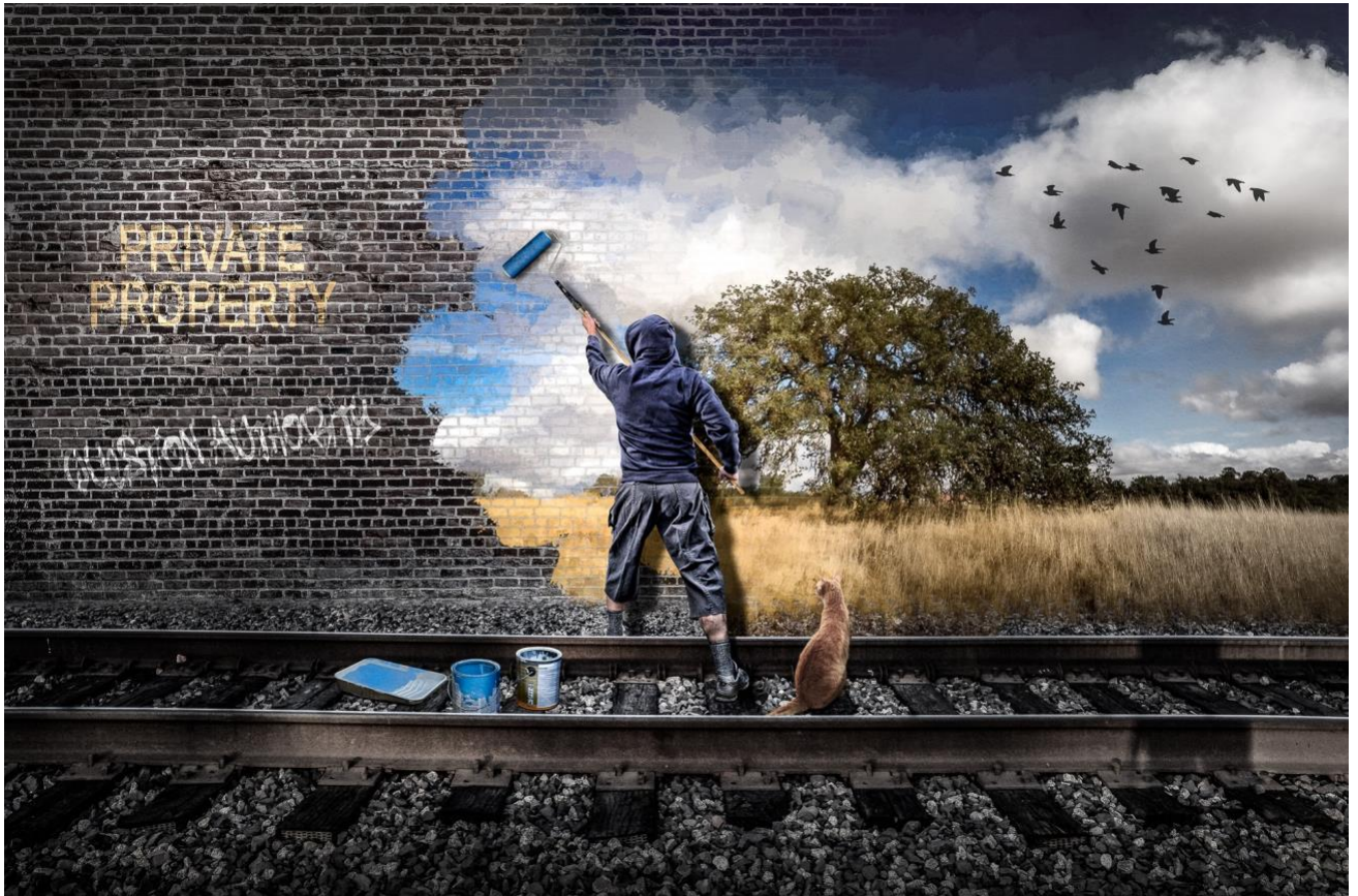
Painting a Better World by Bruce Cook of the Photo Society

Info@CentralCoastArtistsCollective.org https://www.centralcoastartistscollective.org