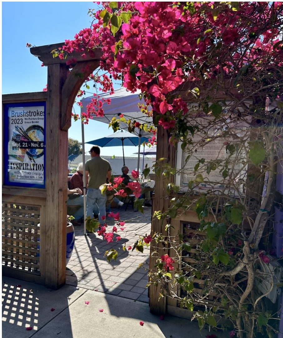
Looking ahead to Brushstrokes 2024 at Art Center Morro Bay

Reception: August 11, 2-4 pm, Art Center Morro Bay