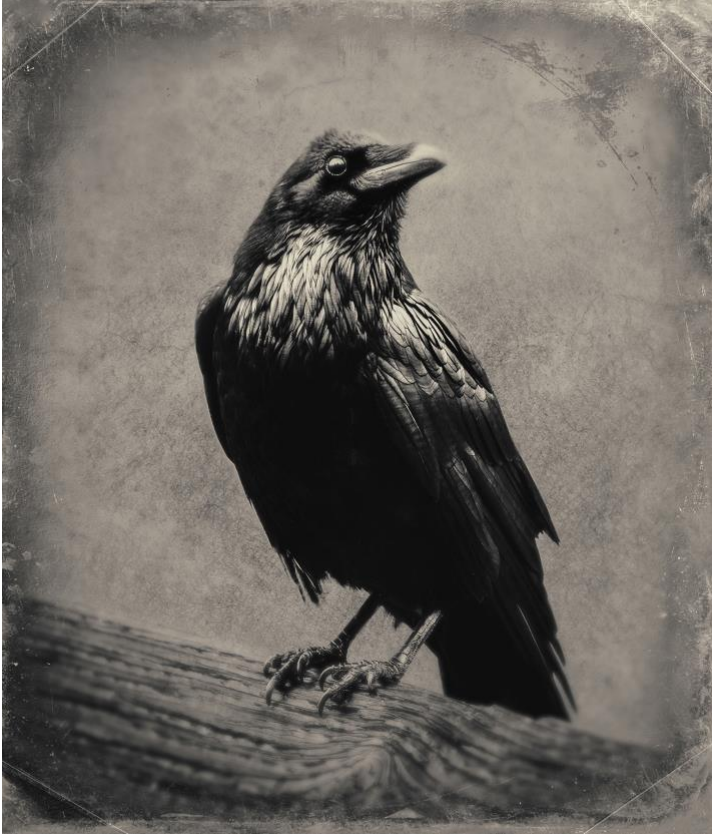
Yosemite Raven