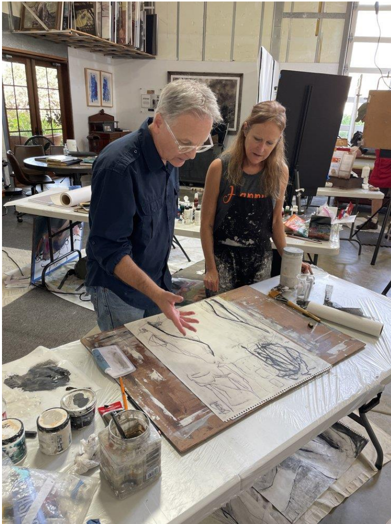
Willow Pond SLO

https://www.willowpondslo.com/artist-workshops-san-luis-obispo