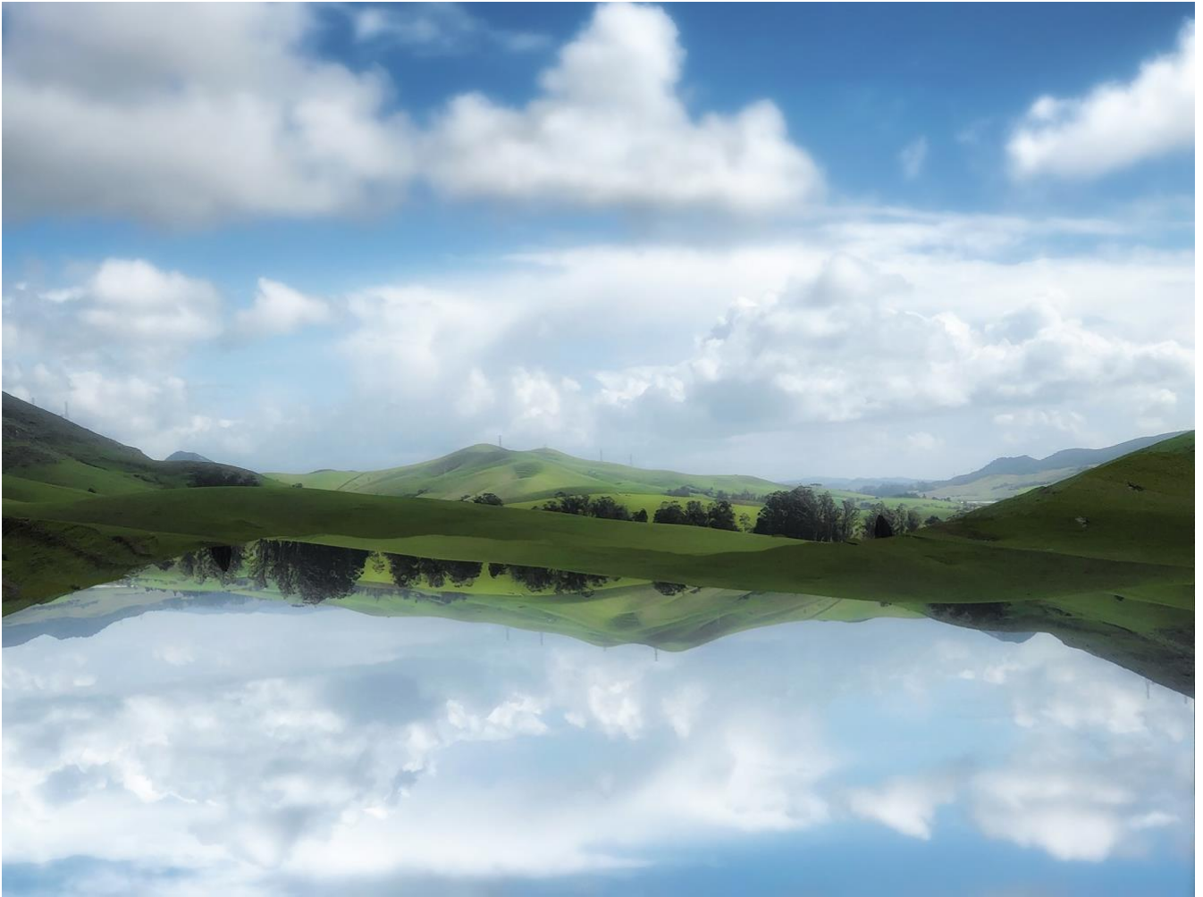
Turri Road Dreamscape by Denise Taylor

My stock photography portfolios are represented by Getty Images and Millennium Images. I currently exhibit my fine art photography at Art Center Morro Bay and on my website www.denisetaylor.net And my fine art, stock and daily adventures are on my Instagram at @denisetaylor and @denisetaylormonochrome