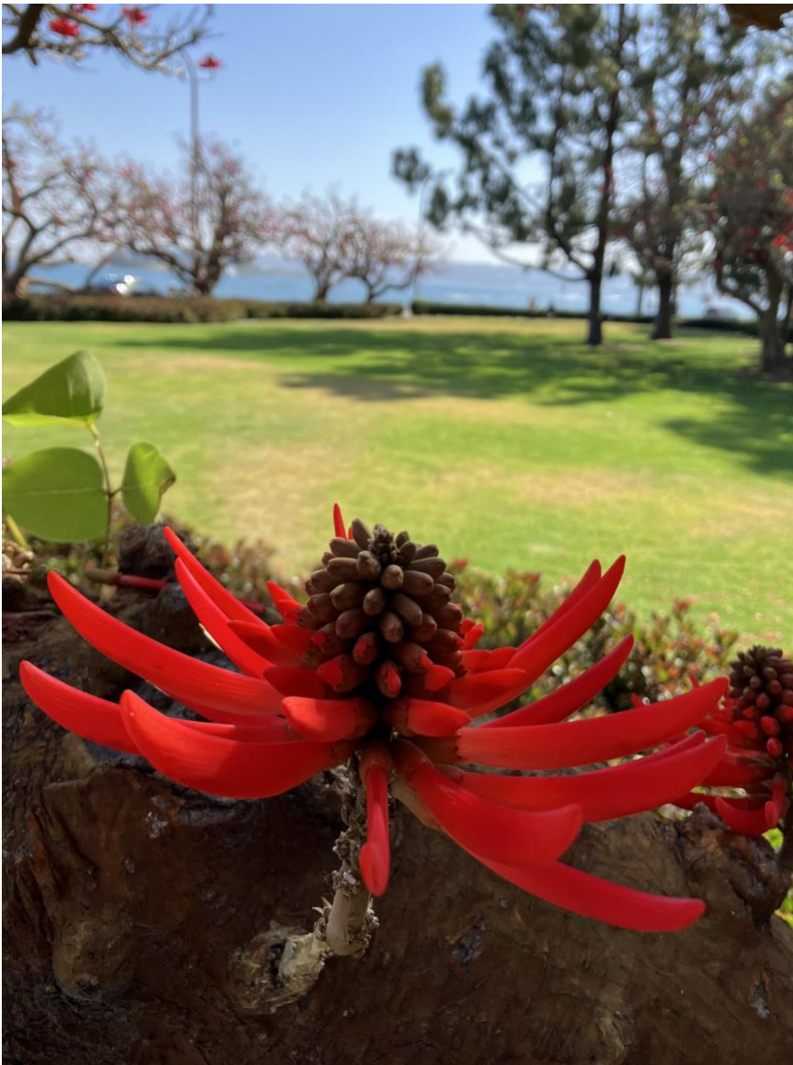
"Expect the Unexpected" by Shiana Seitz from the Photo Society's "Flowers" Members Challenge in June

September 12: CC Photo Society Meeting — TBD