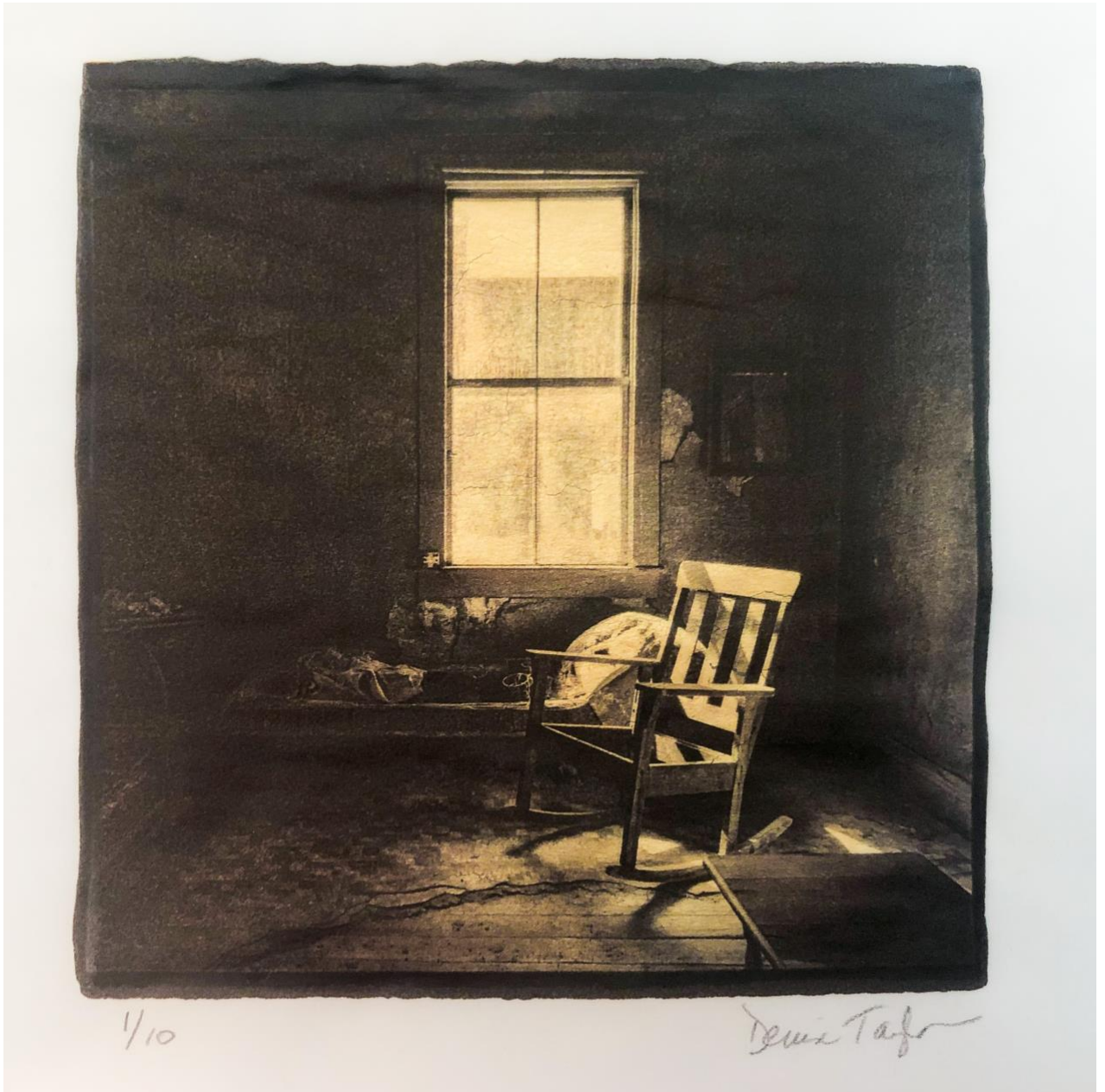
Old Chair, mixed media with gold leaf

I've been in love with photography ever since I received a Kodak Instamatic when I was a kid, but my passion didn't become an obsession until I switched from film to digital a number of years ago. I create color digital images as well as specializing in black and white digital infrared images. In addition, I have recently begun creating mixed media photographs using gold leaf and pastel applications onto digital photographic prints.