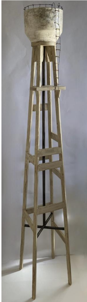
Water Tower by Cynthia Moreno, ceramic, wood, wire, 63 x 10 x 10"

Relatively new to art, most of my sculptures begin with clay though I regularly incorporate other mediums in my ceramic pieces, such as metal, wood, or found objects. I'm particularly drawn to architectural shapes. I am fascinated with starting a sculpture and having it take unexpected turns to become a final version of itself.