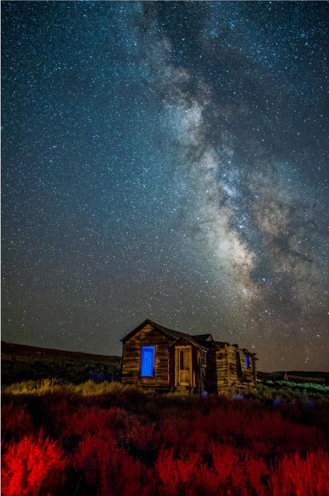
Milky Way Over Bodie